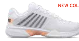
96614-425-M Barely Blue/White/Peach Nectar HB SOLE