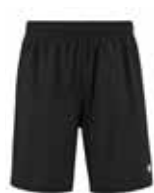
104245-086 Limo Black