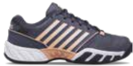
96989-034-M Graystone/Peach Nectar/White

Weight: 9.53 oz/270 gr and 9.85 oz/279 gr