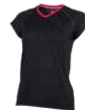
192370-023 Black Beauty