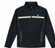
104915-405 Blue Graphite / Soft Neon Green