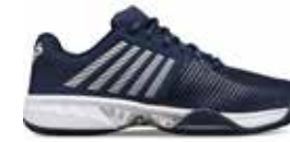
06611-401-M Navy/White HB SOLE