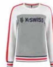
194234-990 Ox Melange / White