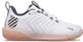
96988-172-M White/Peach Nectar/Graystone