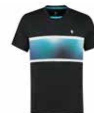
104241-087 Limo Black / Algiers Blue