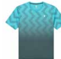
104911-456 Scuba Blue / Dark Shadow