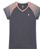
194933-044 Graystone / Panther Print

90% Polyester / 10% Elastane / Face Brushed / 180gsm