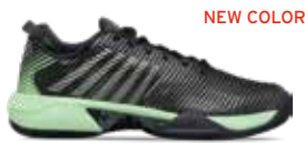
06617-405-M Blue Graphite/Soft Neon Green HB SOLE