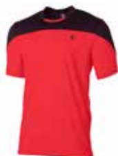
102357-984 Lollipop / Black