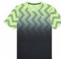
104911-333 Soft Neon Green / Blue Graphite