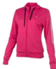
192380-697 Pink Yarrow