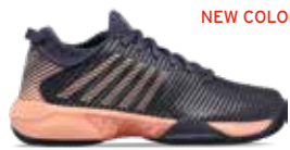
96617-032-M Graystone/Peach Nectar HB SOLE