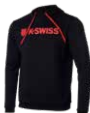
104199-093 Lollipop / Black