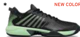
06615-405-M Blue Graphite/Soft Neon Green OUTDOOR SOLE