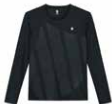
104913-427 Blue Graphite