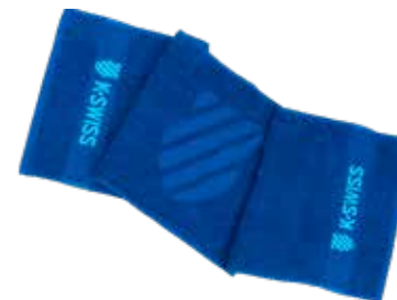
019636 Brunner Blue