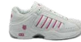
91033-127-M White/Very Berry