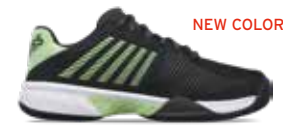
06611-406-M Blue Graphite/Soft Neon Green/White HB SOLE