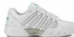
95369-159-M White/Hawaiian Ocean

AÖSTA 70 RUBBER COMPOUND durawrap K-EVA DRAGGUARD 180 PSC PLANTAR SUPPORT CHANNEL