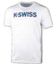
102369-126 White / Brunner Blue