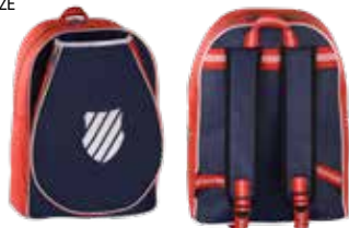
4 18902 206 Navy/Fiesta/White