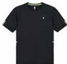
104909-427 Blue Graphite