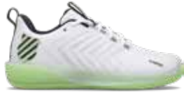
06988-191-M White/Soft Neon Green/Blue Graphite