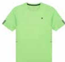
104909-332 Soft Neon Green