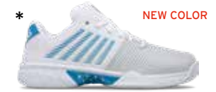
06744-168-M White/Swedish Blue OUTDOOR SOLE

K-EVA AÖSTA 70 RUBBER COMPOUND 180 PSC PLANTAR SUPPORT CHANNEL durawrap flex