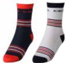
3 18671 104 Bright White/Navy/Red