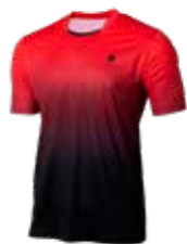
102356-984 Lollipop / Black