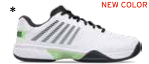
06613-115-M White/Blue Graphite/Soft Neon Green OUTDOOR SOLE