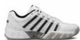
95368-159-M White/Hawaiian Ocean

AÖSTA 70 RUBBER COMPOUND durawrap K-EVA DRAGGUARD 180 PSC PLANTAR SUPPORT CHANNEL