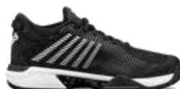
06617-002-M Black/White HB SOLE