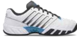
06989-130-M White/Dark Shadow/Swedish Blue

AÖSTA 70 RUBBER COMPOUND durawrap K-EVA DRAGGUARD 180 PSC PLANTAR SUPPORT CHANNEL