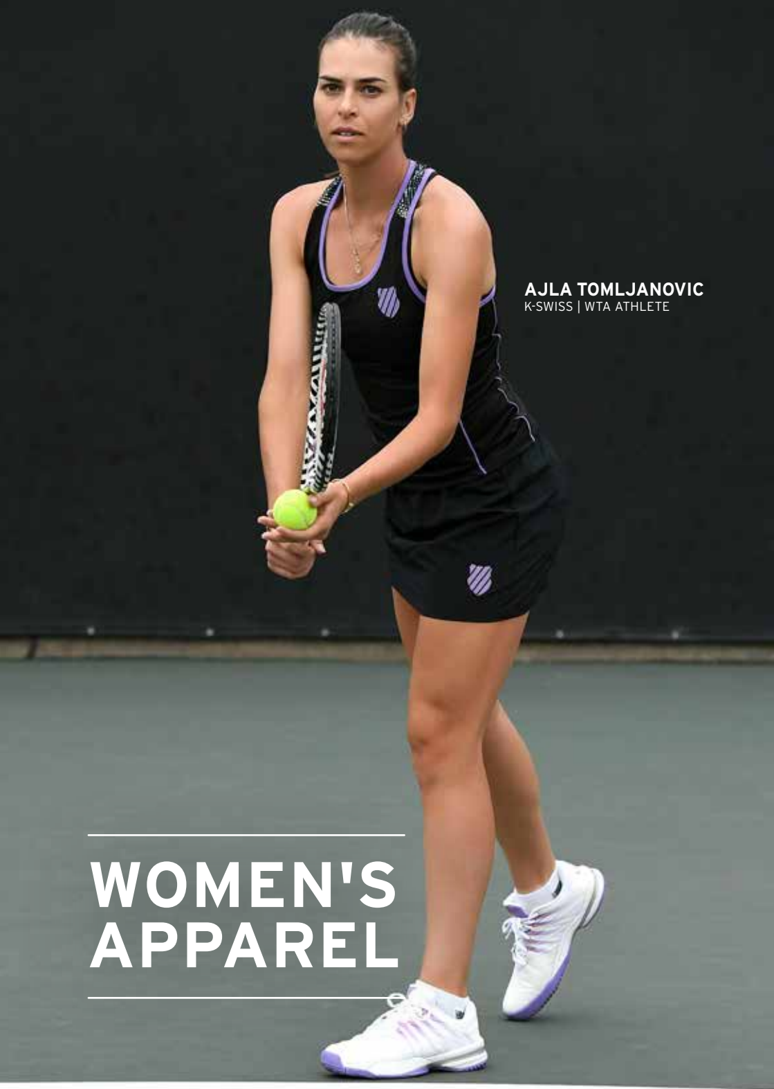
AJLA TOMLJANOVIC K-SWISS | WTA ATHLETE