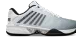
06614-162-M White/High-Rise/Black HB SOLE