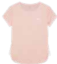
194935-816 Peach Melange