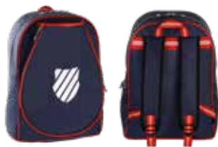
4 18902 403 Fiesta/Navy/White