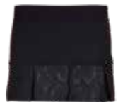
192375-023 Black Beauty