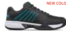
06614-028-M Dark Shadow/Scuba Blue/White HB SOLE