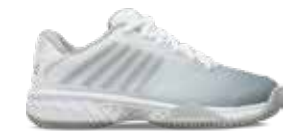
96614-150-M White/High-rise/Silver HB SOLE