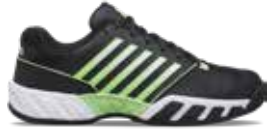
06989-406-M Blue Graphite/Soft Neon Green/White

Weight: 12.14 oz/344 gr and 12.20 oz/345.5 gr