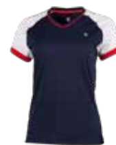
192382-401 Navy / White