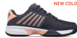
96611-034-M Graystone/Peach Nectar/White HB SOLE