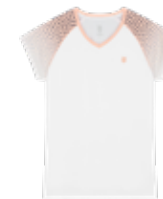
194933-123 White / Panther Print