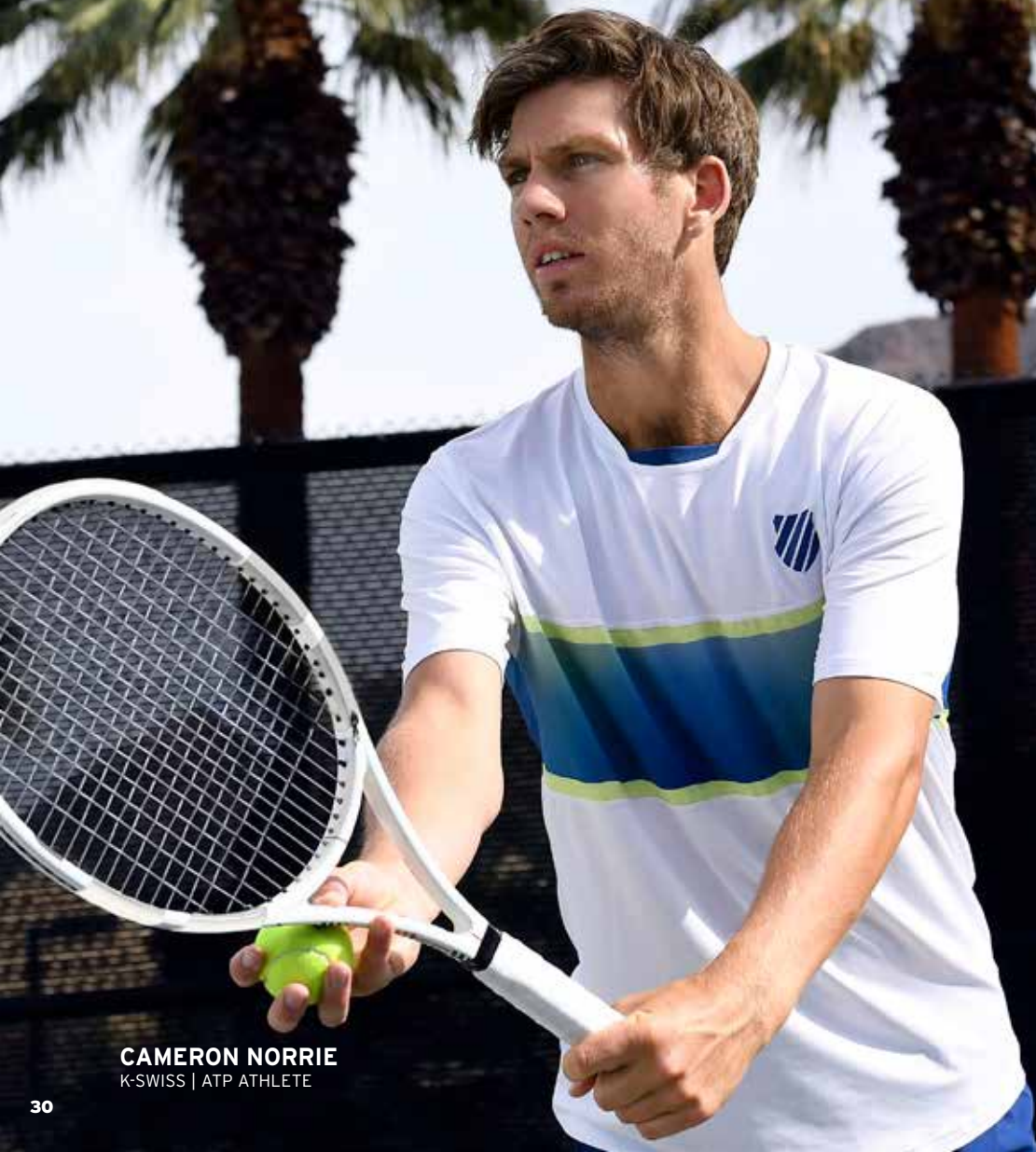
CAMERON NORRIE K-SWISS | ATP ATHLETE