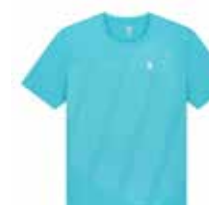
104910-438 Scuba Blue