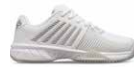
96611-181-M White/Gull Gray HB SOLE