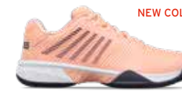
96614-606-M Peach Nectar/Graystone/White HB SOLE