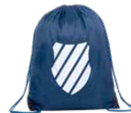
BG068462 Brunner Blue/White