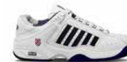
01033-164-M White/Dress Blues/Fiery Red