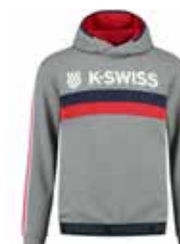
174216-090 Ox. Melange

80% Cotton 20% Polyester 280 gsm Non Brushed