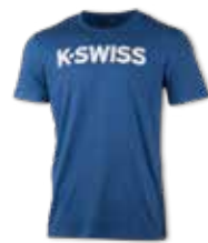
102369-462 Brunner Blue / White