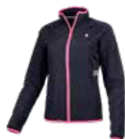
192377-023 Black Beauty