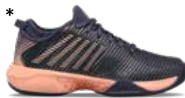
96615-032-M Graystone/Peach Nectar OUTDOOR SOLE