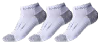
SX9100-100 WHITE/LIGHT GREY EU 35-38 and EU 39-42