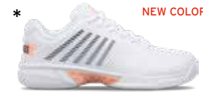
96613-172-M White/Peach Nectar/Graystone OUTDOOR SOLE