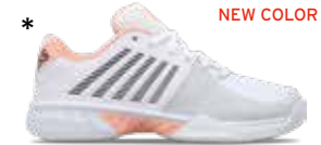
96744-172-M White/Peach Nectar/Graystone OUTDOOR SOLE

K-EVA AÖSTA 70 RUBBER COMPOUND 180 PSC PLANTAR SUPPORT CHANNEL durawrap flex