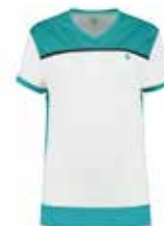
194237-171 White / Aruba Blue

90% Polyester 10% Elastane Face Brushed 180 gsm