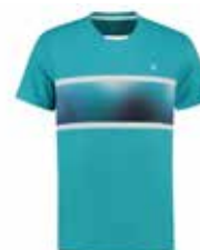
104241-429 Algiers Blue / White