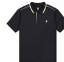
104908-427 Blue Graphite