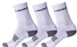
SX0099-100 White EU 39-42 and EU 43-46